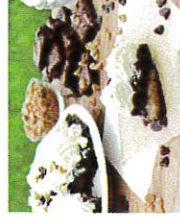
Chocolate Peanut Butter