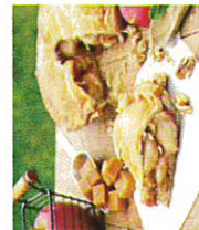
Apple Caramel Walnut