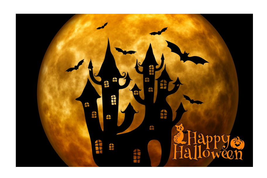
Save the Date!!